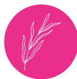
Flora & Fauna