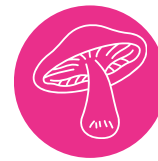
Natural food sources